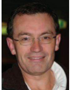
CASPA Youth Coordinator