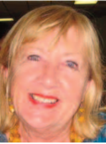
CASPA Coordinator/Matell Liaison