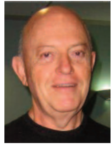
Newsletter Editor ATB