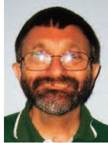
CASPA Ratings Officer/ Web Coordinator/Records Officer